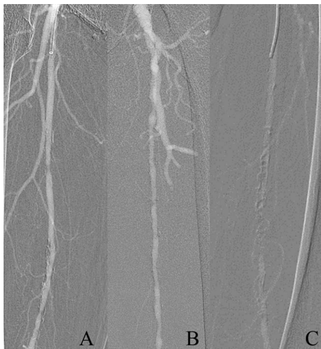
Fig. 1. Study Design: CO 2 angiography-guided EVT. Patient enrollment numbers: consented (101), protocol violation (3), AI group (31), SFA group (62), and RAS group (16).

contrast media were used to identify the lesion and for stent placement.