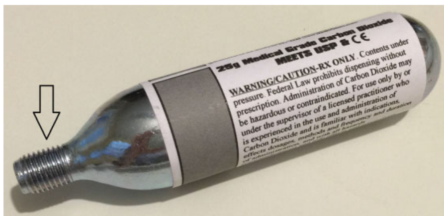
Fig. 1 Compact, disposable CO 2 cylinder containing 10,000 mL of laboratory grade carbon dioxide. Threads (arrow) are unique to the CO 2 mmander regulator preventing attachment of other gaseous cartridges.

A compact CO 2 medical gas cylinder (→ Fig. 1), portable low-pressure regulator, and pre-assembled delivery system was manufactured to achieve the aforementioned primary goal. In this system, there is the use of a compact 10,000-mL laboratory grade CO 2 cylinder. The cylinders are triple-washed before filling. The cylinder has special threads which are unique to the regulators for which it is inserted. This prevents the insertion of inappropriate gas canisters to the regulator. The laboratory grade quality of CO 2 exceeds the recommended medical grade purity for CO 2 vascular imaging. The cylinder is disposable eliminating the initial difficulties and complications of reusable cylinders and large “disposable” cylinders that are not depleted over a long period of time. Despite being described as reusable, many of the large tanks are not depleted allowing bacteria, molds, mildew, carbonic acid, rust and other contaminants dwell within. Large tanks are also cumbersome and tip easily, which can damage regulators and valves and preclude or delay use during a procedure. The smaller cylinders with the CO 2 mmander system (AngioAdvancements, Inc; Ft. Meyers, FL) can be