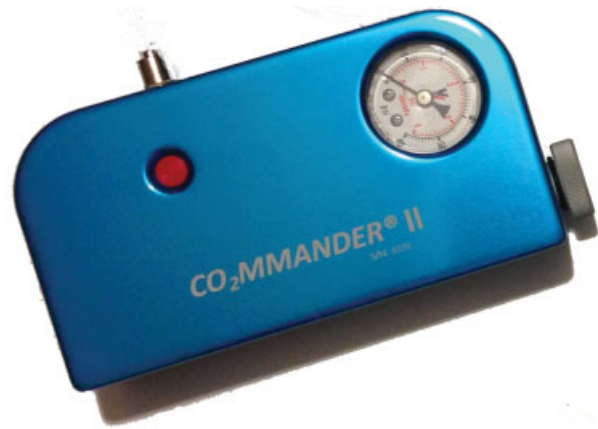
Fig. 2 Petite, CO 2 mmander regulator that converts liquid CO 2 in the cylinder to a gas at low pressures unlike the large cumbersome tanks. Also, as opposed to the traditional tanks, all components including the valve are internalized and protected by an airline aluminum shell making it more durable.

The delivery system, termed the AngiAssist (► Fig. 3 ) is preassembled and consists of two one-way valves, a reservoir