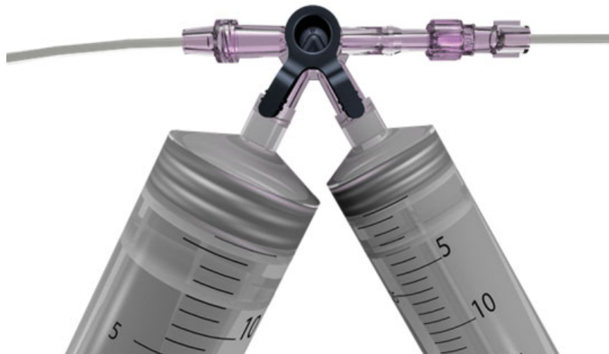
Fig. 4 Proprietary K-valve. Gas can only traverse in the direction of the stems or 60 degrees.

180-degree flow and the CO 2 regulator can never transfer gas directly to the patient. The stems on the valve demonstrate the 60-degree direction of flow to reduce inappropriate delivery.